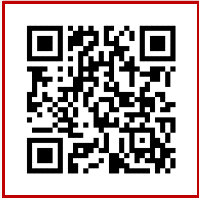
EPI YouTube Channel Videos of Various EPI Products