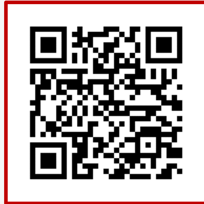
POSDemo Team's Calendly Links